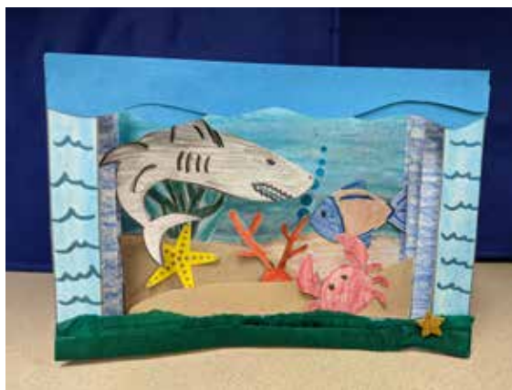
Amanda Raiche of Edith B. Siegrist Vermillion Public Library Vermillion, SD

In the ocean or in aquariums, let's talk about fish! Two crafts—an accordion book and a fish tank—are provided for older and younger children, respectively. Adjust the pictures or create new silhouettes to match any ocean theme. Suggested runtime: 45–60 min.