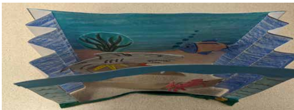
Amanda Raiche of Edith B. Siegrist Vermillion Public Library Vermillion SD

Optional: Craft sticks, sandpaper or other textured material, magazines for children to cut out ocean images, misc. craft materials for plant or ocean life (tissue paper, construction paper, buttons, sequins, chenille stems, ribbons, etc.), ocean-themed stickers or stamps, watercolors or pastels, cardboard to back the project if using plain paper