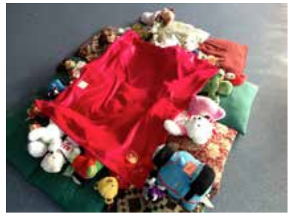
{\bf Image\ Source: The\ Erlanger\ Branch\ of\ the\ Kenton\ County\ Public\ Library}