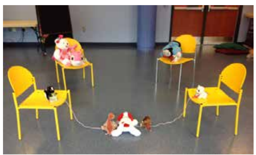
Image Source: The Erlanger Branch of the Kenton County Public Library